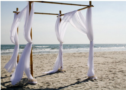
BAMBOO CANOPY (Fabric Draped) $175

*Pool deck ceremony option is not available from Memorial Day through Labor Day