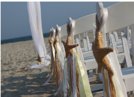
CEREMONY CHAIRS $4.50 per Chair