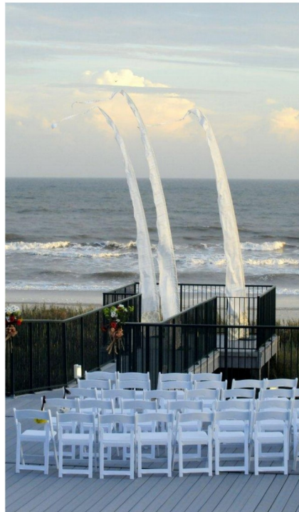
BALI FLAGS Three for $125